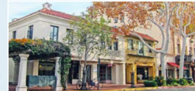
1224 State Street Prime Retail/Office Space ±3,350 SF